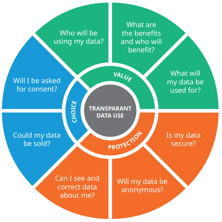
Fig. 2. Elements of transparent data use

In New Zealand, an independent ministerial advisory group funded and appointed by the Government conducted a wide-ranging consultation to build an "inclusive, high-trust, and high-control data-sharing ecosystem" (280). The guidelines include eight questions about what matters most to people in building trust in data use and whether the use of data provides value, protection and choice for an individual (Fig. 2).